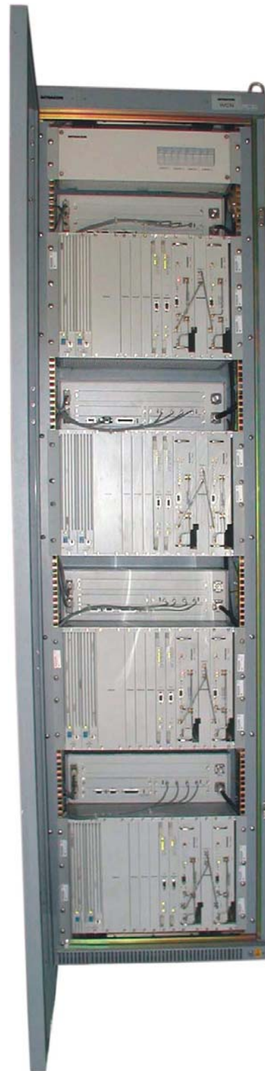
Wireless Central Node (WCN)

The ExSS sub-rack includes a number of units responsible for the analog system interface: - the ECU (Exchange Concentrator Unit), EXIC (Exchange Interface Card), and PSV (Power Supply Voice).